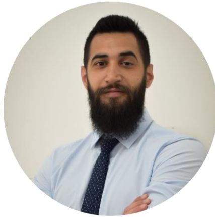
JOSEPH AL ABBOUD